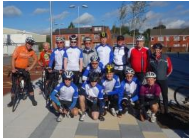
Rochdale Riders Ready for 7,000ft in 7 Hours