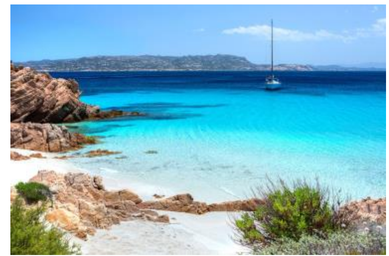
Riding Round La Magdelena Island

We spent a couple of days riding round the Costa Smeralda, a playground for the rich, famous and probably our club chairman. Vastly overrated with lots of traffic but the trip over to La Magdelena Island was well worthwhile, where else can you combine riding with sunbathing on pristine white beaches and emerald green seas? Certainly not Southport!