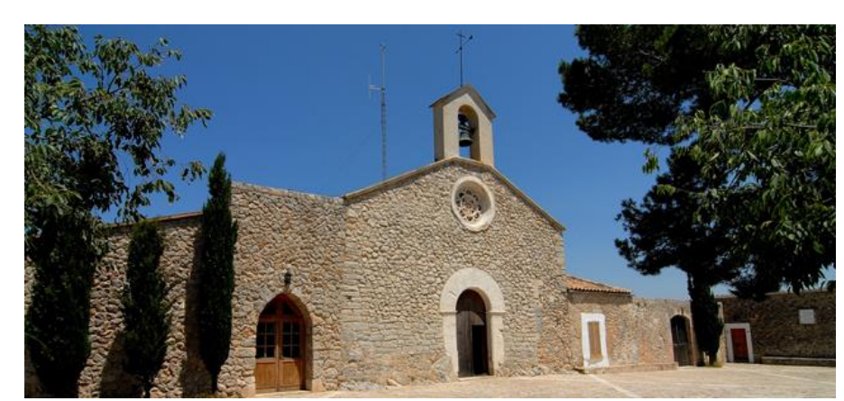
Santa Magdelena/Puig de Inca

17<sup>th</sup> September Short & Medium Rides to Beard Cup Hill Climb Diggle