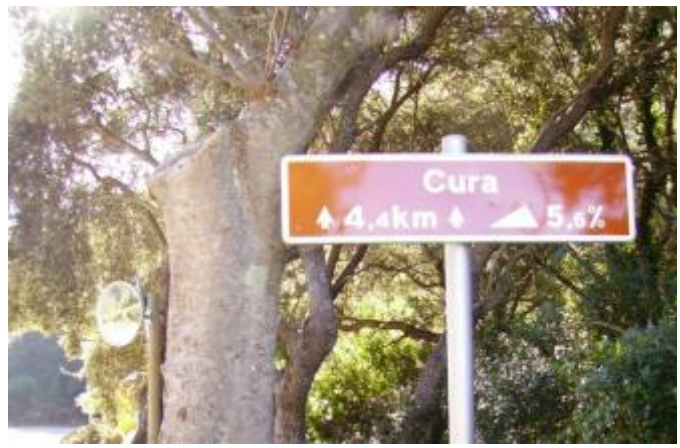
Start of the Randa Climb Proper

Everyone going to Majorca will have heard of the Sa Colabra and Lluc climbs but there are some lesser known climbs that are equally as good. Here are three of my favourites. Firstly, the Cat 3 climb from Randa up to the monastery accessed from Algaida or better still a 7Km quiet road from Monturi. The climb proper starts at Randa and works its way up for 5Km at an average gradient of 6% with great views at the top and a fine cafe.