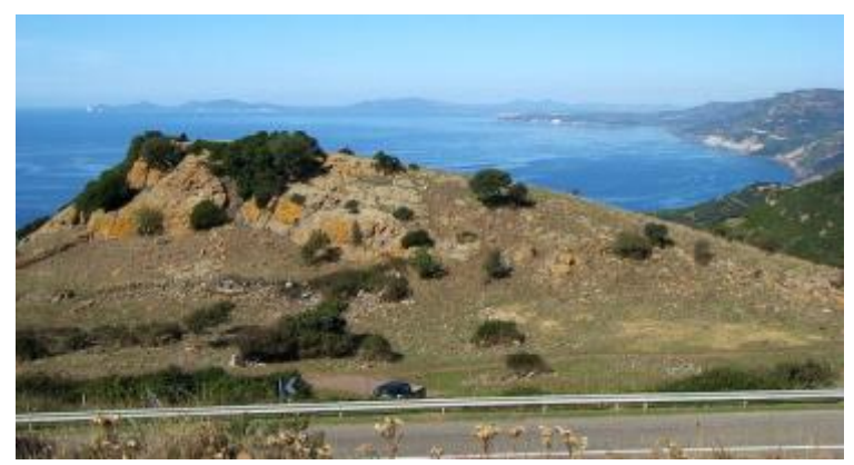
The Road From Alghero to Bosa

Details of the sessions and dates can be found <u>here</u>.